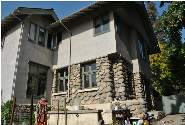
Villa Carlotta, Altadena, Los Angeles County

their full-time residence. The primary façade is hidden from the street by trees and has a subdued appearance. The building rear is more articulated, with a prominent cross gable, and fenestration placed to enhance the connection between indoor and outdoor, and provide dramatic views of the surrounding landscape. Battered piers on the first floor, and portions of ground floor wall, are faced with arroyo stone. The second floor and a portion of the first floor are stucco. The roof is cross-gabled with a central ridge chimney and a clay tile roof.