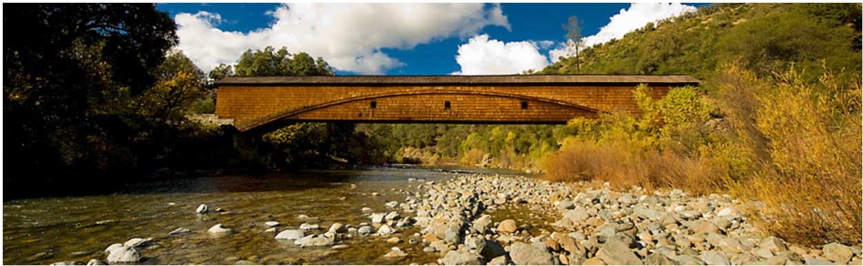
Bridgeport Historic District, Penn Valley, Nevada County

Bridgeport Historic District is an update to California Historical Landmark Number 390. The 1947 nomination for the Bridgeport Covered Bridge documented the significance of the bridge alone, recognizing its unique combination truss and arch construction and its role as the longest single span wooden covered bridge in the United States. The nomination was updated to document the significance of additional resources in the district, including the associated Virginia Turnpike, the 1862 barn, the 1927 gas station, and the Kneebone Family Cemetery. The district is at the west end of South Yuba River State Park on the western slope of the Sierra Nevada. The portion of the Turnpike in the district follows the original route and the rock walls are of original construction. The district also includes remnants of other buildings and structures of the Thompson/Cole/Kneebone Ranch. The barn was used to house and feed large wagon teams transiting the Virginia Turnpike as well as provide a facility for repair of those wagons. It now contains conserved wagons and carriages of the historic period of the Virginia Turnpike and the agricultural industry. The gas station has been restored to its original appearance.