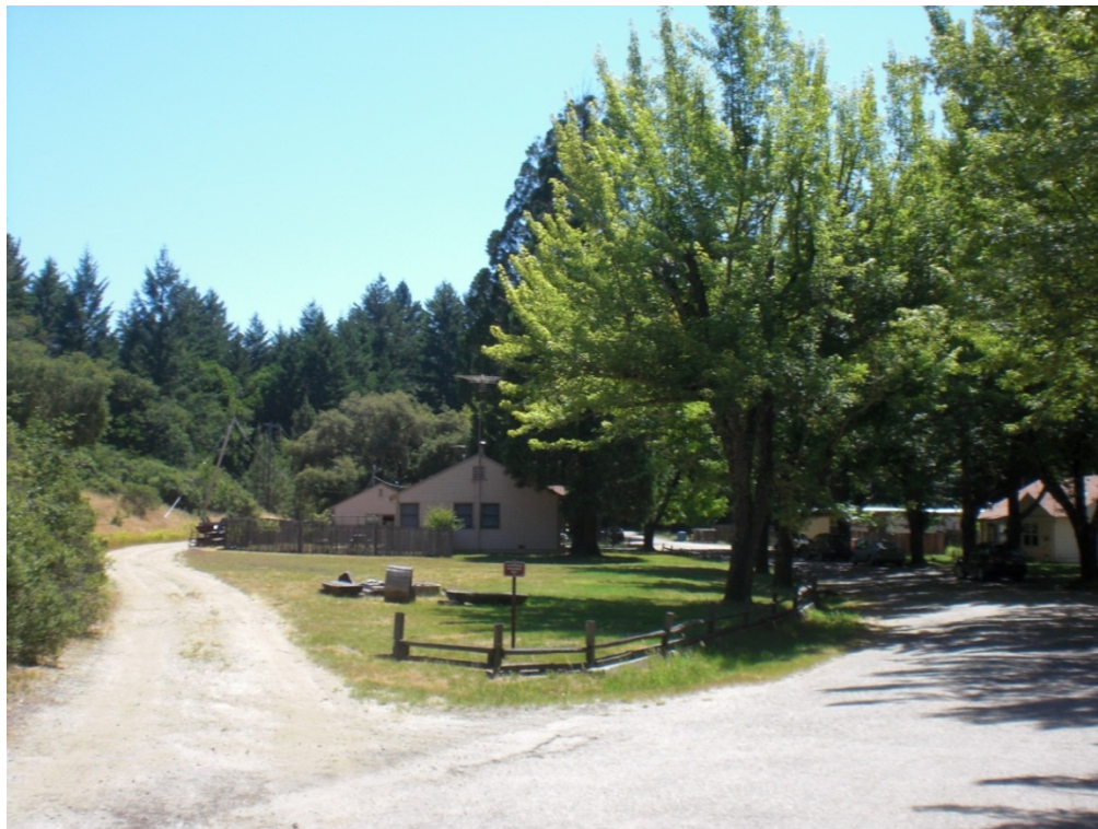
Lower Sky Meadow Residential Area Historic District Boulder Creek vicinity, Santa Cruz County

Museum/Nature Center Buildings, Comfort Stations, Outdoor Theaters and Campfire Centers, Campgrounds, Picnic Areas, and Associated Features, and Trails. The geographic area of the MPS is within the boundaries of Big Basin Redwoods State Park. The park lies in the Santa Cruz Mountains of California, forty-three miles southeast of San Francisco and twenty-three miles northwest of the city of Santa Cruz. Park headquarters is nine miles north of Boulder Creek. The park contains 18,130 acres of land in one large and several smaller, noncontiguous parcels. It includes almost the entire Waddell Creek watershed. Big Basin is an oval-shaped depression, bounded by high hills and containing a number of streams that converge into Waddell Creek on the west side of the park. The park is characterized by steep, north-south running ridges, canyons, perennial streams, and old-growth redwood forest. Elevations range from sea level to more than 2,000 feet. Established in 1902, Big Basin Redwoods is California's oldest state park.