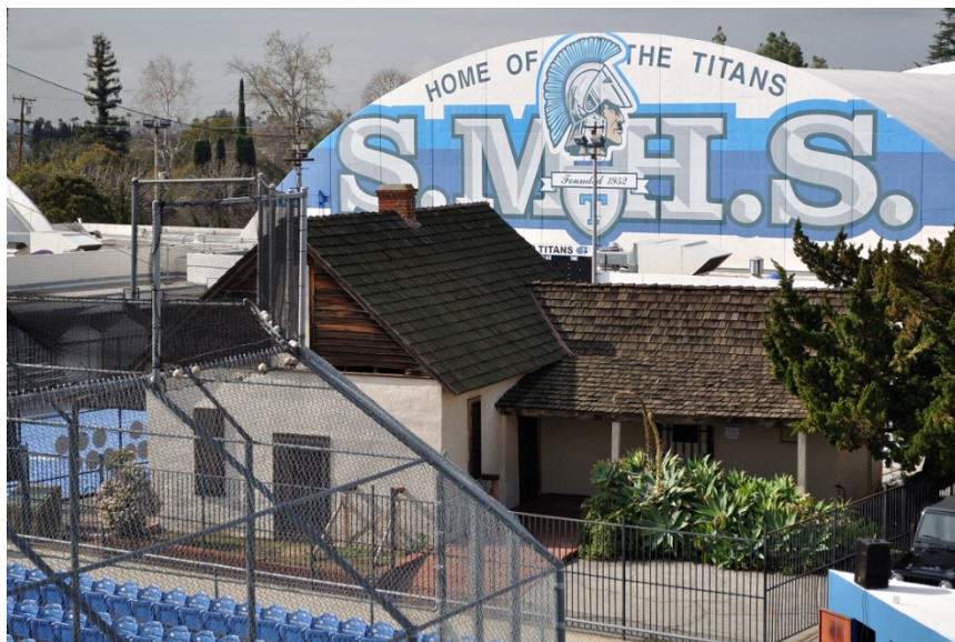
Michael White Adobe, San Marino, Los Angeles County

The Michael White Adobe is a three room adobe building of approximately 925 square feet, located on the campus of San Marino High School. The adobe was originally constructed circa 1846 and has been modified many times, including expansion, repair, and restoration. It was documented in 1936 for the Historic American Building Survey program as a rare example of nineteenth century adobe construction. The adobe is L-shaped with two wings, a two-room south wing with walls of 22-inch wide adobe blocks laid as headers, and a one-room north wing with narrower, 12-inch wide adobe blocks laid in a running bond coursing. The steeply pitched roof is wood framed covered with wood shakes, with horizontal shiplap siding on the gable ends. Fenestration generally consists of double-hung wooden windows, and some of the original window openings in east and west gables are blocked. The building was covered in an exterior stucco finish in 1952 as part of a restoration effort, with two sections of the stucco removed and framed as viewing portals to observe the exposed adobe masonry.