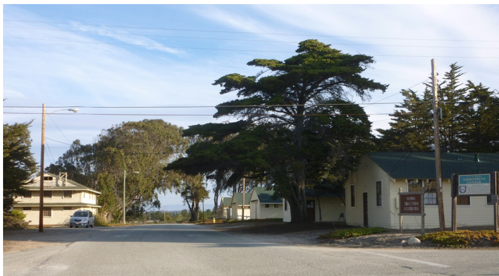
Fort Ord Station Veterinary Hospital, Marina, Monterey County

The Fort Ord Station Veterinary Hospital (SVH) is a set of six Series 700 WWII mobilization era buildings, intended to be temporary, at the corner of Fifth Avenue and Ninth Street on the former Fort Ord in Marina. The buildings occupy their original positions in a footprint of approximately 1.8 acres. The SVH is bisected by Fifth Avenue into an eastern set of five buildings, owned by the City of Marina within the 35-acre Marina Equestrian Center municipal park, and a single western veterinary barracks owned by the Marina Coast Water District. All are slab on grade floor and wood frame construction, except the barracks, which is post and pier. The buildings are uniform in appearance and aligned in a row facing Fifth Avenue, spaced forty feet apart. They display substantial architectural integrity and features related to veterinary use, such as sliding doors for horses and abundant windows and roof ventilators for air circulation. Much of the original hardware, including light switches, doorknobs, cabinet latches, and drain covers, and all but one of the original windows, is intact. Additional original contributing resources are four concrete watering troughs, two hitching posts, one horse stock, and three wash racks.