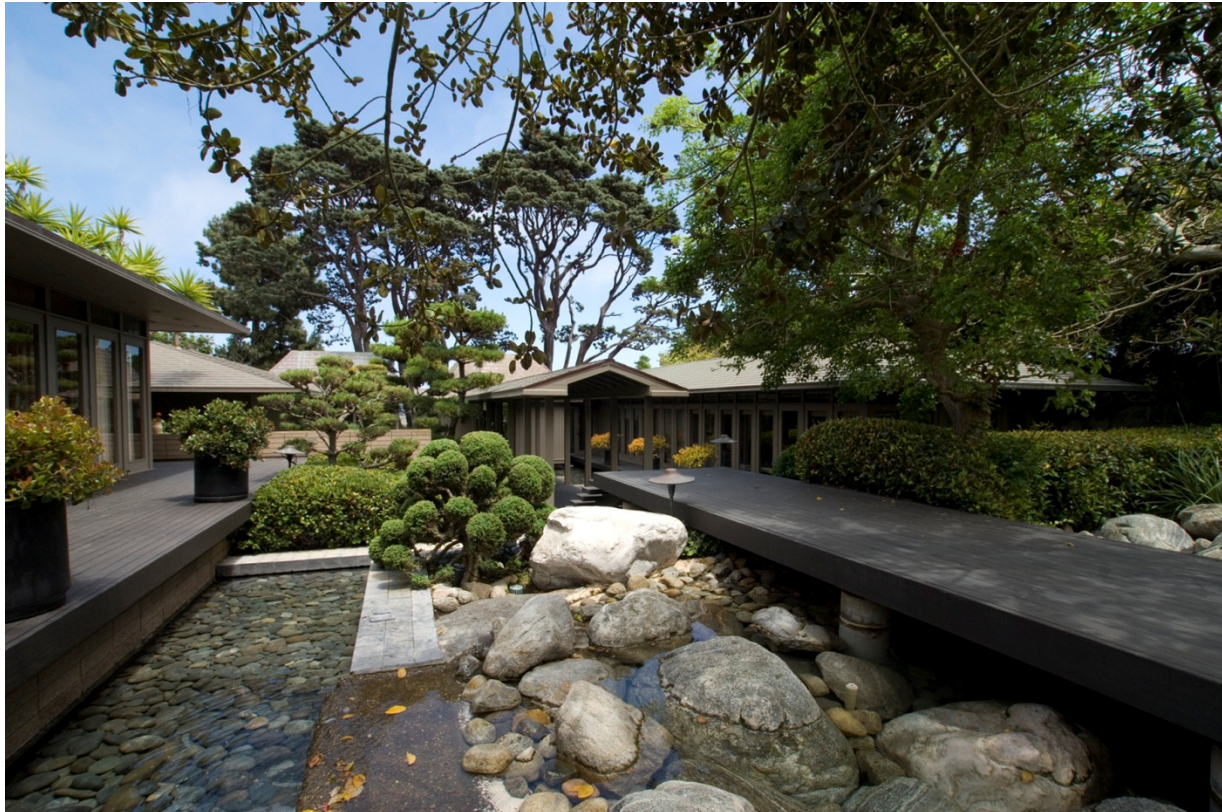
Robert O. Peterson – Russell Forester Residence, Point Loma, San Diego County

overhanging eaves are the most common roof form. Typical fenestration consists of massive floor-to-ceiling panels of tempered glass. Full-height glazed wood doors open to exterior wrap-around redwood decks and catwalks. In addition to the main residence, the property contains a small compound of auxiliary buildings including a detached bedroom and laundry building, a multi-car garage, guard house, also used as a guest house, and “floating” tea house, plus a gardening shed. The property conveys a strong atmosphere of peace and tranquility and retains a high level of integrity.