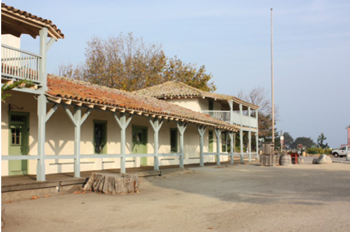
Custom House, California Historical Landmark #1, Monterey, Monterey County