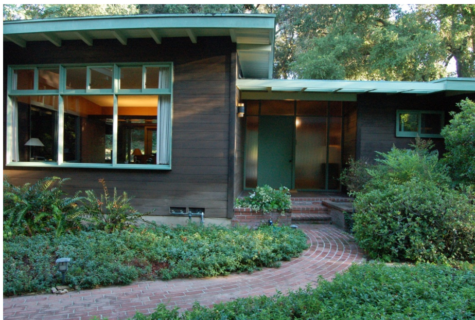
Franklin Rosborough House, La Cañada Flintridge, Los Angeles County

exhibits the modest scale and massing, horizontal emphasis, and asymmetrical plan associated with Mid-century Modern homes. Though additions were made, the house retains integrity and significant character defining features. The property is eligible under Criterion B