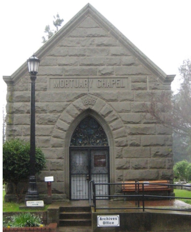
Sacramento City Cemetery Sacramento, Sacramento County

including large canopy elms along the western end, rose gardens, and other landscaping of grass and flowering shrubs throughout the cemetery.