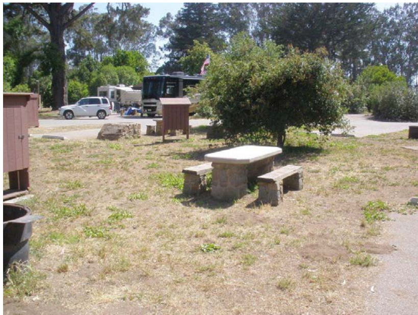
Morro Bay State Park Trailer and Tent Campground Morro Bay, San Luis Obispo County

campground was constructed in 1937-38 by CCC Camp SP-17 at Morro Bay as part of the national–state park cooperative program, and is one of the earliest and best examples of campground facilities designed and executed in the Park Rustic architectural style. The property meets the requirements of The National–State Park Cooperative Program and the Civilian Conservation Corps in California State Parks 1933-1942 Multiple Property Submission as a campground facility that