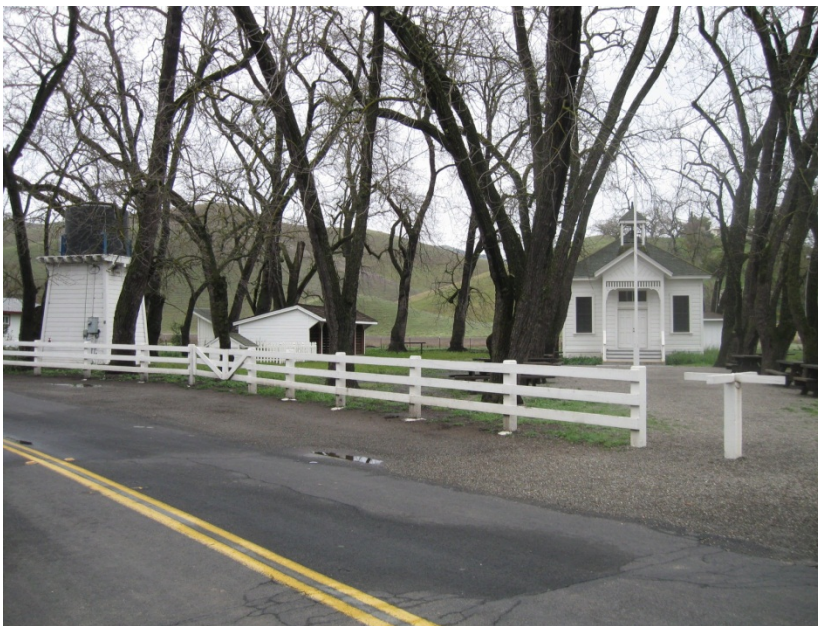
Tassajara One Room School, Contra Costa County

Tassajara One Room School is a vernacular Victorian era building constructed in 1889 to serve as a schoolhouse for the children of the rural community of Tassajara Valley, east of Danville. The redwood framed building features horizontal tongue-and-groove siding and a front-gabled porch supported by rectangular wooden posts with a decorative wooden balustrade and brackets above the entrance. The pyramidal roof is of moderate pitch, topped by a small, open-sided belfry with its own pyramidal roof. Windows are narrow double-hung wooden sash with nine lights in each sash. The main entrance is a pair of six-panel double doors topped with a pair of glazed transom windows. The schoolhouse includes some elements of Stick style architecture and is primarily vernacular in style. It was designed and constructed by architect Julius L. Weilby for use as a school.