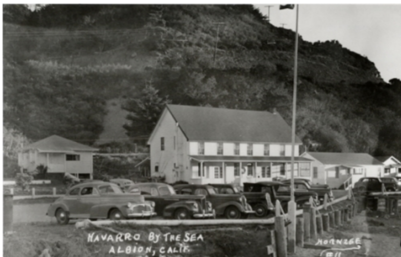
Captain Fletcher's Inn