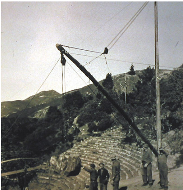
Mount Tamalpais Mountain Theater Mill Valley vicinity, Marin County

Mount Tamalpais Mountain Theater is an open-air amphitheater in the north central section of Mount Tamalpais State Park. Secondary contributing resources include three outbuildings, a series of trails in a designed landscape, and two stone fountains. Designed by landscape architect Emerson Knight and constructed of natural stone in the Park Rustic style by enrollees in the Civilian Conservation Corps (CCC), the theater on the southeast slope of Mount Tamalpais accommodates approximately 4,000 people. Mount Tamalpais Mountain Theater retains its integrity and effectively conveys the initial design effect through a near unspoiled historic fabric. The theater is eligible for listing at the local level of significance under Criterion A for its association with the CCC, an influential