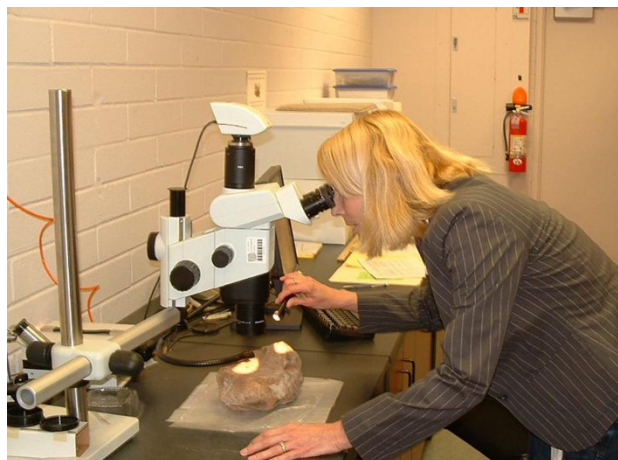
San Diego Archaeological Center

The San Diego Archaeological Center is at the forefront of preserving and supporting archaeological collections that are tangible links to the region's cultural and historical identity. The Center was purpose-built to effectively preserve, manage, and use archaeological collections and is considered a model institution at the local, state, and national levels. It meets federal and state regulation requirements and meets and exceeds Native American Graves Protection and Repatriation Act repatriation standards. In the past fifteen years the Center welcomed more than 40,000 visitors, delivered workshops and lectures, hosted exhibits and special events, partnered with more than fifteen organizations to conduct archaeological research, and provided educational programs for K-12 and college students.