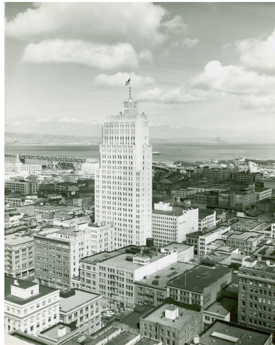
140 New Montgomery Street

140 New Montgomery Street , San Francisco, was designed by noted Art Deco architect Timothy Pflueger in 1925. At the time of its construction it was one of the tallest skyscrapers on the West Coast. Originally home to the Pacific Telephone and Telegraph Company, this 26-story terra cotta and granite building includes a richly detailed façade and dramatic lobby. The rehabilitation project seismically retrofitted the building, and upgraded it as a state-of-the-art office building, while preserving its historic character and key spaces. The ornate lobby is the hallmark of the building and was retained in its entirety and carefully restored as were elevator lobbies, the plaster ceiling, marble walls, and floors. 140 New Montgomery Street has regained its status as an iconic home for some of the region's most forward-looking companies. (Perkins+Will)