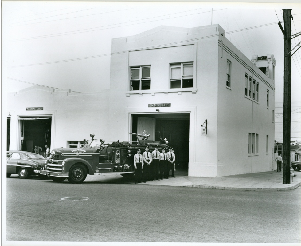
San Diego Fire Department Shops at Station 6 San Diego, San Diego County