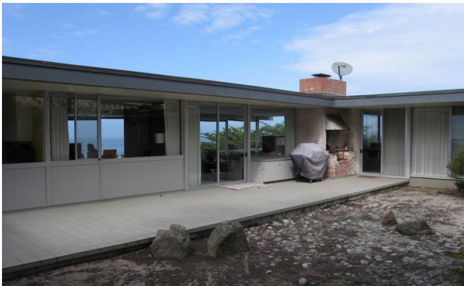
Arthur and Kathleen Connell House, Pebble Beach, Monterey County

Completed in 1958, its period of significance, the Connell House was determined eligible at the local level under Criterion C in the area of Architecture. It is an excellent example of the International Style within the Modern Movement in Pebble Beach, and representative of master architect Richard Neutra's mid-century