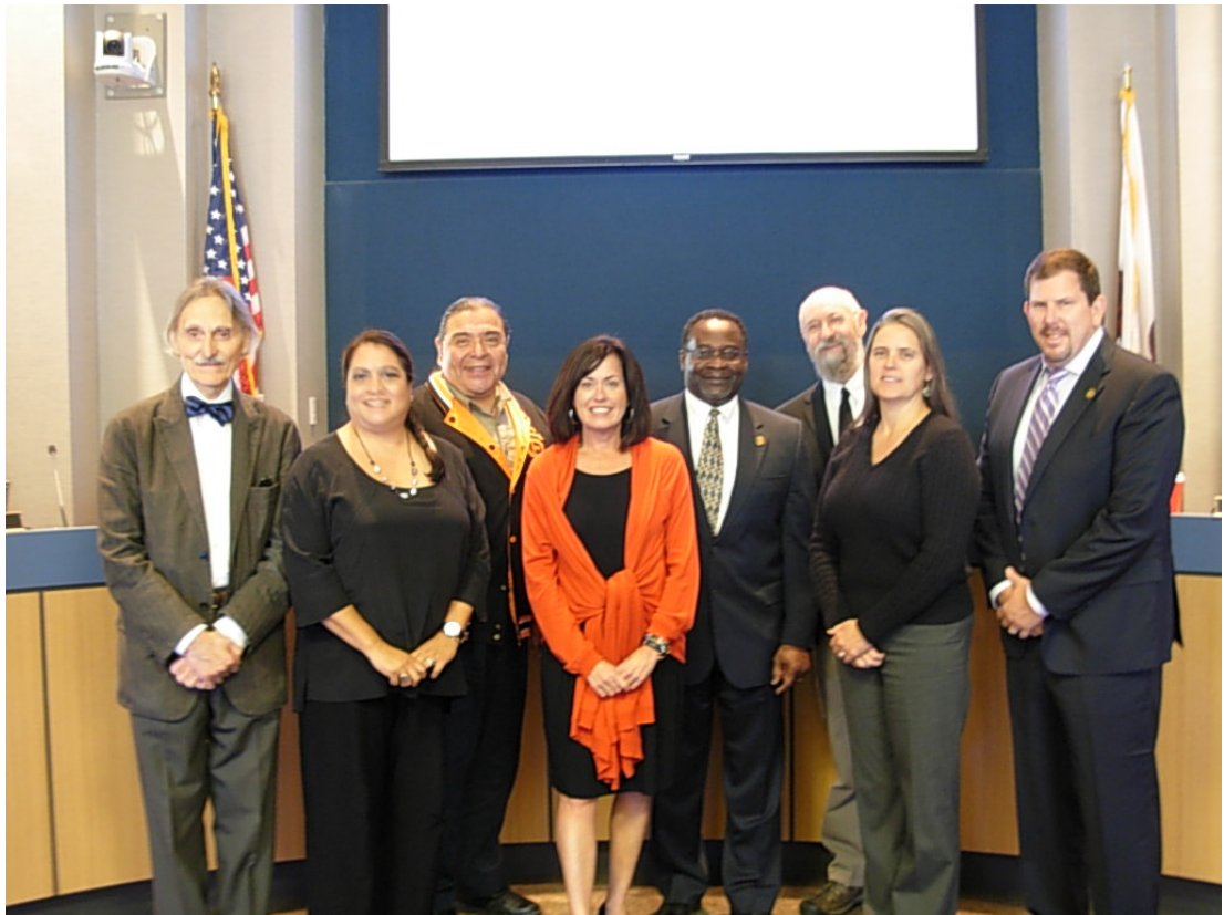
Members of the State Historical Resources Commission Sacramento Historic City Hall, Sacramento, November 7, 2014

The State Historical Resources Commission is pleased to present its 2014 Annual Report to the Director of California State Parks and to the California State Legislature. The Annual Report summarizes the activities of the State Historical Resources Commission in 2014 and identifies future preservation goals for 2015 pursuant to the provisions of Public Resources Code, Section 5020.4(a)(13). A complete description of the powers and duties of the State Historical Resources Commission is provided in Section 5024.2-4 of the Public Resources Code.