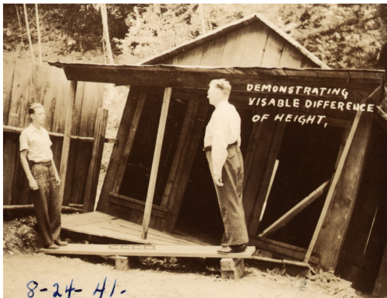
The Mystery Spot, Santa Cruz, Santa Cruz County