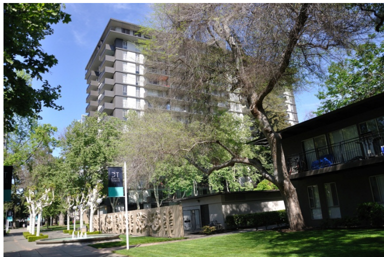
Capitol Towers, Sacramento, Sacramento County

The initial construction of 92 garden apartment units, completed in 1960, represented the first private investment in Sacramento to replace the blighted neighborhoods demolished by the Sacramento Redevelopment Agency