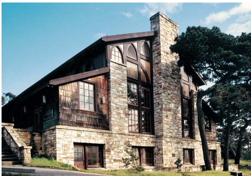
Asilomar, Pacific Grove, Monterey County

Asilomar is located in the coastal community of Pacific Grove, established in 1913 by the Young Women's Christian Association (YWCA) as their first permanent conference grounds for the western United States. Asilomar's development by the YWCA came at a time of progressive social and political change for California women. Like women nationwide, California women were actively asserting the role they could play in shaping modern society. To develop their new conference grounds, the YWCA chose architect Julia Morgan, who had successfully confronted preconceptions about women in the workplace and helped redefine this role for others. Born and raised in the San Francisco Bay Area, Julia Morgan was one of the first women to earn a civil engineering degree from the University of California at Berkeley. In 1901, Morgan was the first woman to graduate from the renowned architecture program at the Ecole des Beaux Arts in Paris. Upon returning to America, she became the first woman to receive California's State Architectural License.