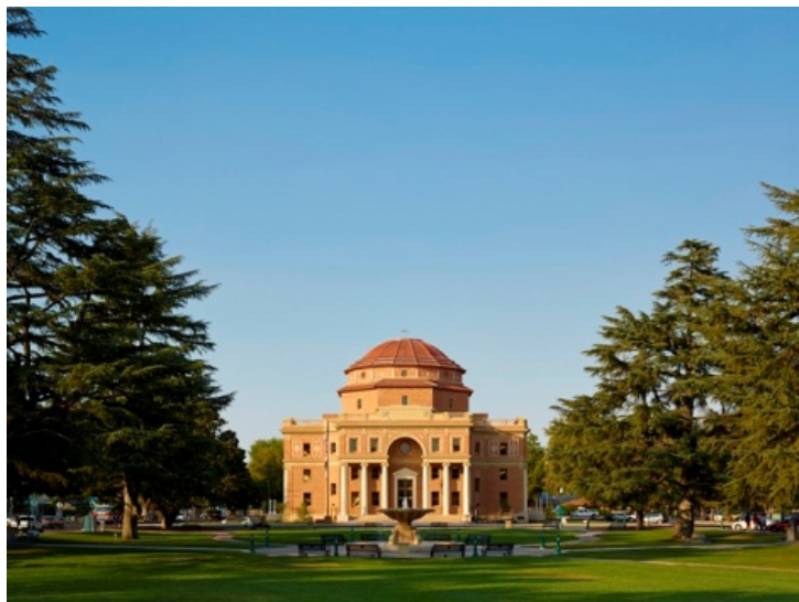
Atascadero City Hall

others, rotunda overlooks, and architectural design motifs. With carefully located portals that allow visitors to see the original building and enhanced reinforcement, and two rooms restored back to their 1918 appearance, the building serves as both a center of civic activity and an educational space for highlighting the community's rich heritage. (Pfeiffer Partners)