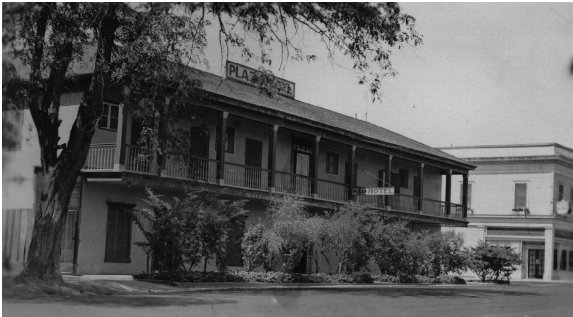
Plaza Hotel, San Juan Bautista, San Benito County

The Plaza Hotel was designated California Historical Landmark Number 180 in 1935. Built in 1792 as a one-story adobe, by the mid-nineteenth century the building was the home of the Anzar family. Later it was leased to a merchandise firm and then sold to Angelo Zanetta, an Italian immigrant and talented chef. Zanetta removed the roof of the original adobe and added a second story of timber. He opened the building as a hotel in January 1859. The Plaza Hotel became noted for its fine cuisine and liquors. By the late 1860s seven stage lines passed through San Juan Bautista. The Plaza Hotel was the official stopping point and contained eighteen furnished rooms for guests. Two or three stage drivers remained in readiness to operate an extra stage when heavy traffic created a demand. When the Idriana quicksilver mines opened just to the southeast, even more patrons frequented the hotel. The advent of the railroad slowed patronage of the Plaza Hotel, as it discontinued the stagecoach line and bypassed San Juan Bautista. Though business decreased, the hotel maintained a healthy trade and remained open until 1933 when it was purchased by the State of California.