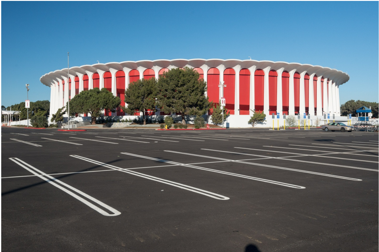
Forum, Inglewood, Los Angeles County

Myron Hunt. The property retains a high degree of historic integrity, including distinctive interior features designed by Hunt including an oak library with built-in shelves, bathroom fixtures and tile, the original oven and stove, and seven original Alexander Graham Bell telephones used as a custom-designed intercom system. Hunt's other works include buildings on the campus of the California Institute of Technology, the Huntington Library, Occidental College, and the Pasadena Public Library. Hunt was considered a pioneer in styles that integrated Mediterranean vernacular and California's Spanish colonial architecture. Villa Carlotta's design was adapted to the site and environment of Altadena, including the use of local materials, and a level of integration between indoor and outdoor spaces made possible by Los Angeles' comfortable climate.