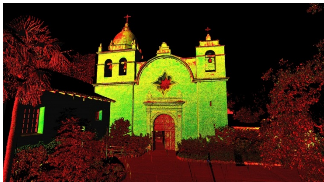
Image of Mission Carmel

CyArk is a nonprofit organization with the mission to leverage cutting-edge technology to digitally preserve and share the world's cultural heritage. Using non-invasive techniques, CyArk captures digital records of heritage sites that are accurate down to millimeters. Since their founding in 2003, CyArk has added over 120 heritage sites to their free online archive. Besides its global activities, CyArk has established strong partnerships with sites and public and