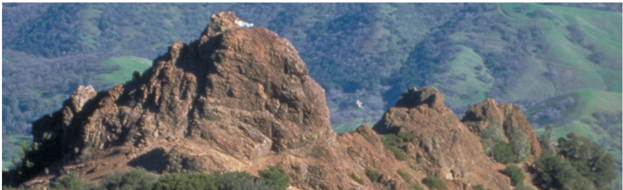
Tomo-Kahni, Kern County

Tomo-Kahni , Winter Village in the Kawaiisu language, is a late prehistoric/protohistoric site affiliated with the Kawaiisu and is located in the southern Sierra Nevada Mountains near Tehachapi. Tomo-Kahni State Historic Park became a unit of California State Parks in 1993. The site contains a range of features associated with long term occupation, and includes numerous discrete locations throughout the area of the park. A number of features have been recorded at the site, including food processing areas with bedrock mortars, milling slicks, rock art panels on boulders and within shelters or caves, and concentrated deposits of artifacts. The rock art recorded throughout the site contains stylistic elements from the Great Basin and Central Valley cultures. The site includes a complex of ceremonial features, and the living descendants of the Kawaiisu consider the rock art sites sacred.