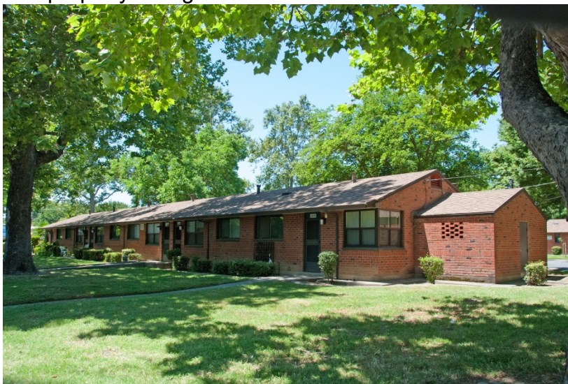
New Helvetia Historic District Sacramento, Sacramento County

The New Helvetia Historic District is located within the Alder Grove housing complex between Broadway, Muir Way, Kit Carson Street, and Kemble Street in Sacramento. There are 62 contributing buildings, including the central community center building at 816 Revere Way. Buildings are wood framed with gabled roofs, clipped eaves, brick cladding, clinker brick, and metal framed windows. The simplicity and lack of exterior ornamentation illustrate the influence of the Modern Movement that focused on the functional aspects of architecture, and reflect wartime economic constraints as well. The buildings are set in a 26-acre rectilinear pattern of organized blocks, asphalt paved streets, and concrete sidewalks, with pathways separated by lawn and containing trees, bushes and shrubs within a defined landscape accessible from major city streets. The one- and two-story buildings are narrow and long, have brick veneer surfaces, side-gabled roofs with composition shingles and clipped eaves, shallow roof overhangs on the side-gabled elevations, small entry canopies above doorways—some with shed-roofs and some flat—and metal framed windows, both sliding and double-hung. There is ample open space within the block layout and parking lots surrounded by lawn. Plantings and open yards without fences are dominant and provide little privacy. A very few units use plantings in their backyards to create small partially private outdoor areas. The property is in good condition.