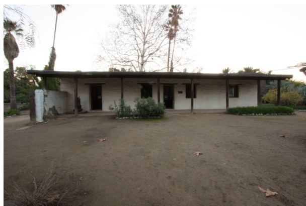
Reid-Baldwin Adobe, Los Angeles County

Built in 1839 and originally known as the Hugo Reid Adobe, the Reid-Baldwin Adobe sits slightly elevated above the southern shore of a spring-fed lake within the 127 acres of the Los Angeles County Arboretum and Botanic Garden. The Adobe is a single story, adobe walled, California Rancho style, residential building. It is rectangular in plan, with its longitudinal axis oriented in the north-south direction. The exterior dimensions of the adobe building are approximately 60 feet long and 20 feet wide. The residence is comprised of three rectangular rooms, which vary slightly in size. In its early years, the Adobe was part of the vast 13,000-acre Rancho Santa Anita, which included all or parts of the present day communities of Arcadia, Monrovia, Sierra Madre, Pasadena, and San Marino. Hugo Reid acquired private use of the property first through a provisional Mexican land grant in 1841, and then formally in 1845. Between 1847 and 1875, the ranch transferred title through a succession of owners, culminating with Elias J. "Lucky" Baldwin. Lucky in business, including silver mining and real estate ventures, Baldwin acquired over 40,000 acres including several ranchos. He sold off sections in the 1880s for the development of town sites, as Southern California entered one of its most significant periods of expansion.