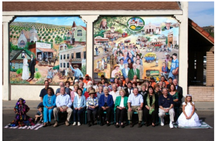
Lemon Grove History Mural

The Lemon Grove History Mural is a community project of the Lemon Grove Historical Society, involving the creation of a 65-foot wide by 18-foot high, five panel mural depicting the history of the Lemon Grove community. The mural is the city's first public art installation, and conveys a strong sense of place and history. Local artists, businesses, and individual citizens all came together to make the project a success. The Lemon Grove History Mural has become a destination point for school groups and public tours, and is a tangible example of grass roots efforts to preserve and interpret a community's past. (Lemon Grove Historical Society)