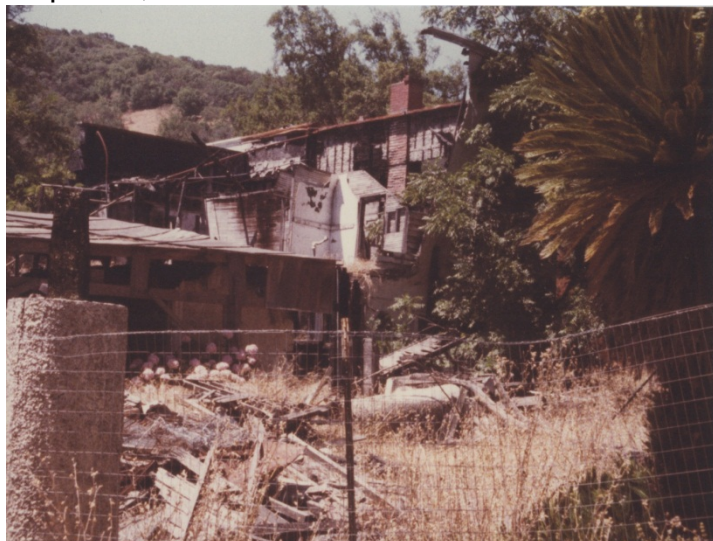
Camilio Ynitia Adobe, Marin County

Camilo Ynitia Adobe , formerly The Oldest House North of San Francisco Bay, was designated California Historical Landmark Number 210 in 1935. The nomination was updated to officially rename the Landmark in recognition of the only U.S. land grant owned and maintained by a Native American in Alta California. Reportedly built as a one-room adobe in 1776 with the assistance of Lieutenant Bodega's survey party under the King of Spain, further research indicates a more likely two part construction beginning in 1834 and possibly after 1843. The original adobe was constructed with stone laid on a lime mortar and a stone foundation, with walls two feet thick when covered by plaster and mud mortar. The adobe formed a "T" shape that measured approximately 2,150 square feet. In 1911, a two-story stucco building known as the Burdell Mansion was constructed over the original adobe and an 1866 renovation that fully encased the adobe within the mansion walls. A 1969 fire left the building in ruins, consisting of adobe walls, fireplaces, and debris.