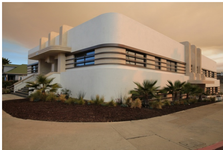
MA Center LA Building

The MA Center LA Building , designed in 1948 in the Streamline Moderne style by architect George Morlan, is an excellent example of its style and is beloved by the local beach community. The building housed the Fraternal Order of Eagles AERIE 935 since its initial construction. In 2012, the Order sold the aging building to the MA Center, who embraced the building's architectural significance. They hired historic preservation experts to restore the