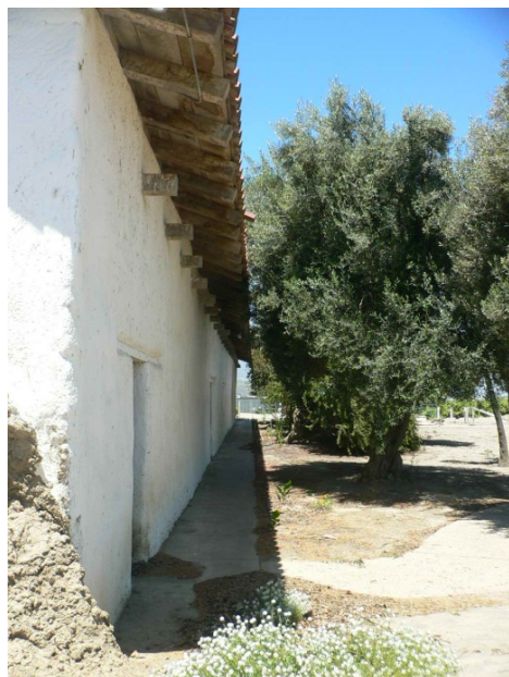
Mission Nuestra Señora de la Soledad Historic District Soledad, Monterey County

Mission Nuestra Señora de la Soledad Historic District is located southwest of the City of Soledad on Fort Romie Road, in the Salinas Valley near the Salinas River and the northeastern edge of the Santa Lucia Range to the southwest, within rich agricultural lands that have been under intensive cultivation for almost a century. To the northeast of the valley lies Pinnacles National Park in the Gabilan Range. The district includes original adobe building ruins and reconstructed adobe buildings as well as an intact historic setting that provides visual acuity to the historic complex. Contributing resources include three buildings, two of them reconstructed; nine sites, including ruins, buried footings, a cemetery, and a gravesite; and two structures, portions of a road and an aqueduct. The district retains integrity of location, setting, materials, workmanship, feeling, and association. It does not retain integrity of design because most of the original above-ground building fabric is no longer in extant condition.