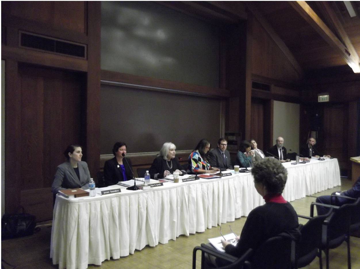
State Historical Resources Commission meeting at Asilomar State Historic Park Pacific Grove, Monterey County, April 22, 2014