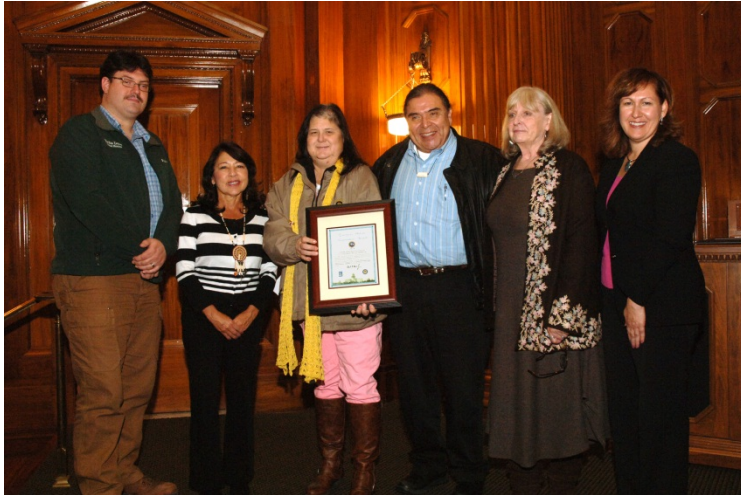
Yocha Dehe Wintun Nation Cultural Resources Committee

rebuilding and revitalizing of the Patwin language. They are developing a history program and have created the largest Patwin archival document and photograph collection. The CRC has promoted the revitalization of other California Indian languages through the sponsorship of the Living Language Circle Conference, which brings together Native American language teachers throughout California to share knowledge and experiences.