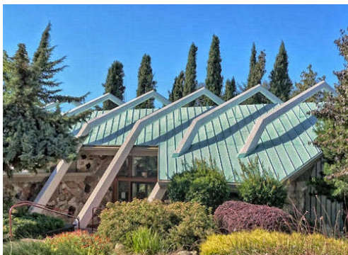
Pilgrim Congregational Church

The Wright Time: A History of the Pilgrim Congregational Church is a film project dedicated to preserving, on video, the story of the construction of the Pilgrim Congregational Church, Redding, California, in the early 1960s. Designed by famed architect Frank Lloyd Wright, the church was built by the men, women, and children of the congregation. While the actual church building itself is historically significant, the focus of the film project was to preserve the human stories and history