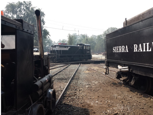
Sierra Railway Shops, Jamestown, Tuolumne County

Sierra Railway Shops is a complex of track, buildings, and structures covering approximately 22 acres in Jamestown, encompassing the historic resources within the boundary of Sierra Railway's steam locomotive shops currently in use as Railtown 1897 State Historic Park. The first Shops buildings were built in 1897 in conjunction with the construction of Sierra Railway, a short line serving the Sierra Nevada range. The complex includes a freight depot, turntable and roundhouse, machine shop, carpenter and blacksmith shops, section house, sand house, oil tank and delivery system. Several of the buildings are recent reconstructions, and are contributors because they embody traditional building methods and techniques, and comply with the Secretary of Interior's standards for reconstructed properties. 38 of the railroad's locomotives and cars are also contributors to the landmark, based on their association with the Shops during its period of significance.