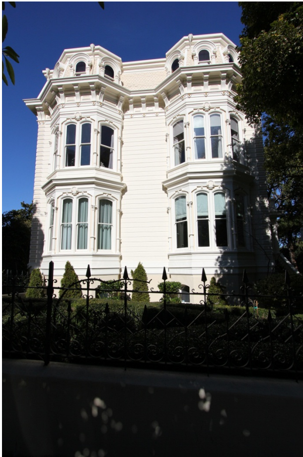
Burr House, San Francisco San Francisco County

The large, angled bays rise from the first through the second floor. Each bay contains quadruple sets of double-hung arched windows with ornately carved hood molding. Colonnets flank the windows, and a scallop rests over the center pairs of windows on each bay. An overhanging cornice with large wood brackets separates the second floor from the mansard level. The mansard features angled dormers with double-hung,