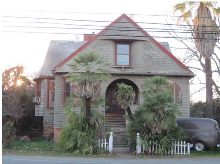
C.W. Swain House, Lone, Amador County