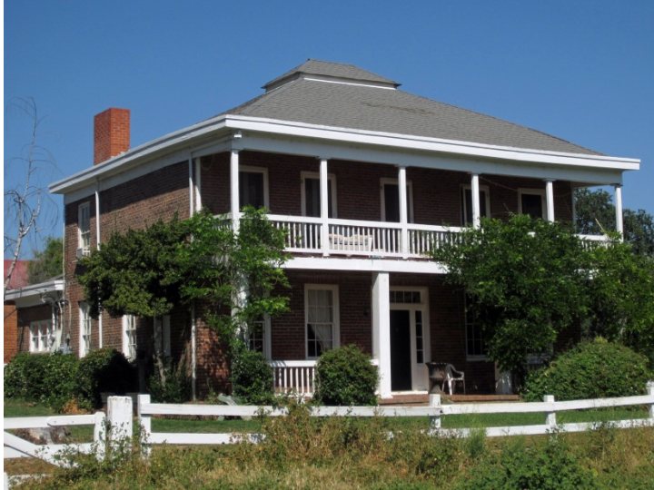
George and Eliza Withington House lone, Amador County

three acres of land along the northern banks of Sutter Creek, the house has a low pitched hipped roof with a large monitor at its peak. The building has an essentially rectangular footprint, with a single story projection on its northeast corner and a rectangular projection in the center of its second story. A full-façade front porch with second story balcony supported by vernacular squared columns dominates the