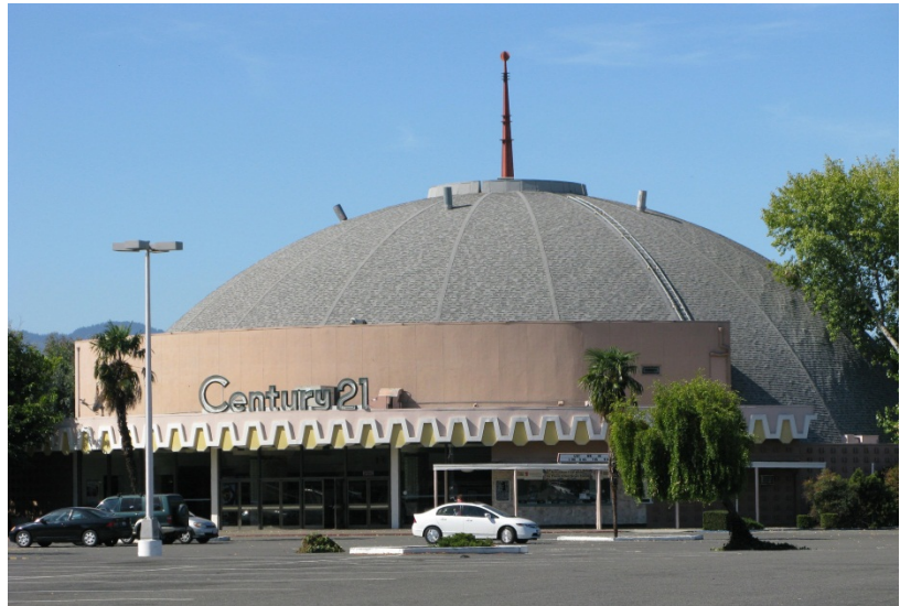
Century 21 Theater, San Jose, Santa Clara County

The Century 21 Theater occupies a 2.44-acre parcel located near the intersection of Interstate 280 and Winchester Boulevard in San José. The theater is a one-story, concrete block, steel frame, domed building containing an auditorium, lobby/concession area, restrooms, projection rooms, and storage. The shingled dome is parasol-shaped, with scalloped eaves, and it terminates at the top with an antenna-like steel finial. The primary façade faces east and consists of a projecting arcade composed of square piers supporting a painted plywood canopy embellished with zig-zag detailing. The canopy is surmounted by a plain stucco parapet, in front of which is a Century 21 neon sign. The primary entrance is located at the center of the primary façade; it is composed of four pairs of glazed aluminum doors surmounted by transoms. The ticket sales area is located to the right of the main entrance and an aluminum frame window wall is to the left. Concrete block wing walls extend beyond the main entry area to the left and to the right, enclosing the lobby. The wing walls are embellished with decorative