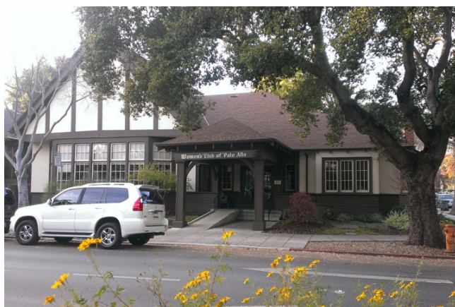
Woman's Club of Palo Alto Palo Alto, Santa Clara County

The Woman's Club of Palo Alto is a one-story meeting hall that combines elements of Tudor Revival and Craftsman styles, with a stucco exterior above a water table at sill height and clapboard beneath the sills. Decorative half-timbering, main entry portico details, doors, and windows are wooden. The building's design suggests residential architecture despite its intended use as a meeting hall for the women of Palo Alto. The