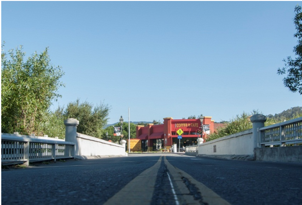
Pilarcitos Creek Bridge, Half Moon Bay, San Mateo County

construction by several decades. The bridge uses Hallidie braided steel-and-hemp wire rope previously used by the city of San Francisco's cable car network. While not technically identical to modern prestressed concrete using rebar under tension, this method uses tensioned steel cable. Reinforced concrete uses steel reinforcing bars embedded passively in the concrete, not under tension, and thus a different method than used in the Pilarcitos Creek Bridge. The property retains a high degree of historic integrity due to limited modification to the bridge structure, other than the addition of two street lamps and the wooden walkways, distinct and separate elements of the bridge. The bridge has suffered physical deterioration, including points where the hemp-cored Hallidie wire rope cables are visible through cracks in the concrete.