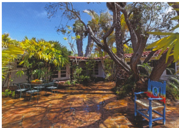
Cottrell House, San Diego San Diego County

Cottrell House is a one-story residence of approximately 2,260 square feet, designed in the Hacienda style by architect Cliff May. Constructed in 1936, the house was designed with a hollow square plan around a central courtyard. It represents a transitional work by May, based on nineteenth century Mexican ranchos around a central courtyard, translated into a twentieth century setting via its lengthy estate-type driveway with wrought iron gate, two-car garage, and separate pedestrian entry. The roof is Spanish tile, stacked and mudded at the gable ends, and of low pitch. Walls are stucco. Windows are