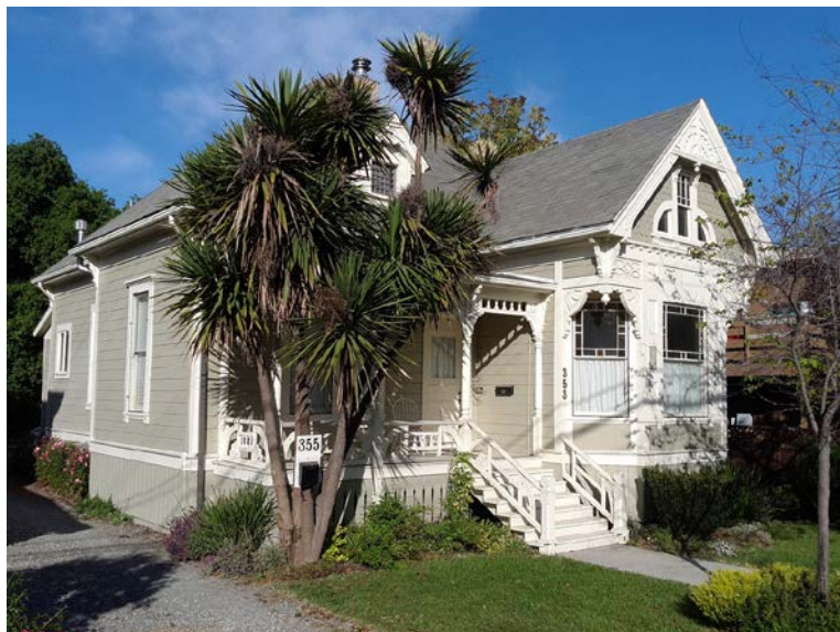
Amelia Vollers House San Mateo, San Mateo County

Mateo and is an excellent local example of the style.