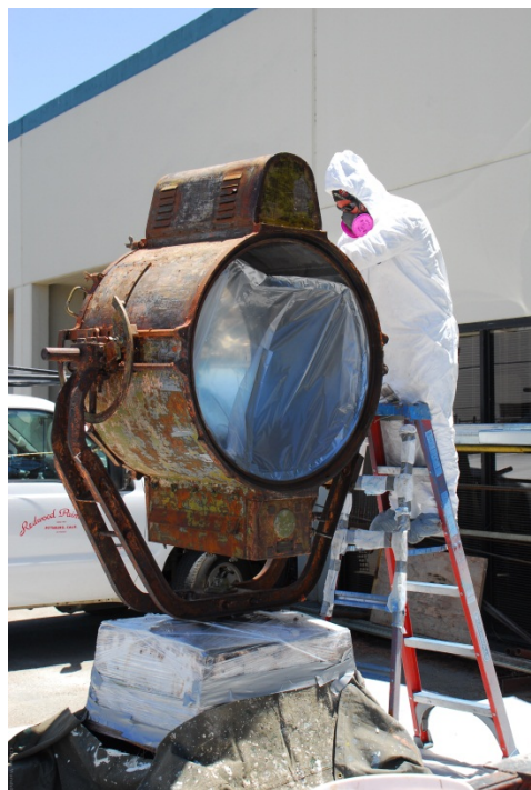
Mount Diablo Beacon

associated with the building's creation and the process of turning Wright's design into tangible form. A captivating blend of historic film footage, photographs, and oral history interviews, the film is available to scholars, researchers, and the public through local libraries and colleges, the Frank Lloyd Wright Foundation, and soon will be available online as well.