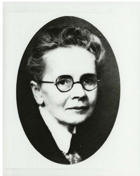
Julia Morgan, Architect of Asilomar

By 1952 the YWCA renewed earlier efforts to dispose of its real estate holdings, and Asilomar was put up for sale. Local citizens formed a "Save Asilomar" Committee that lobbied both the YWCA and the State of California to preserve the property. The committee's work culminated in the purchase of the property by the State. On July 1, 1956, Asilomar officially became a unit of the California State Park System. Asilomar was listed as California Historical Landmark Number 1052 for its association with the YWCA, a group that profoundly influenced the history of California; as an outstanding example of the First Bay Tradition, a regional off-shoot of the Arts and Crafts Movement that emphasized the integration of buildings with their natural surroundings and the use of local, natural materials; and as a more notable work of master architect Julia Morgan, a pioneer of women in the architectural profession. Asilomar contains the largest collection of Morgan's work in the First Bay Tradition and reflects her masterful ability to blend architecture into existing landscapes.