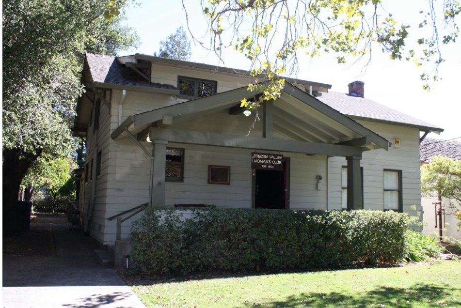
Sonoma Valley Women's Club, Sonoma, Sonoma County

The Sonoma Valley Woman's Club is eligible for listing at the local level of significance under Criterion A in the areas of Social History and Women's History, for its association with the Sonoma Valley Woman's Club, an organization integral and critical to the civic development of the town of Sonoma. The building has been occupied by the club continuously since its construction. The period of significance is 1916, the construction