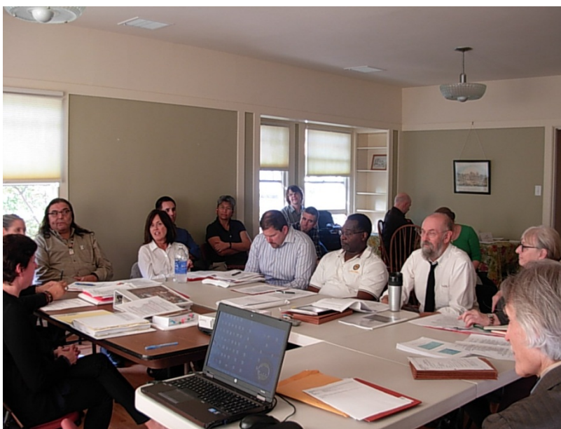
SHRC Workshop, November 6, 2014 Ella K. McClatchy Library, Sacramento, Sacramento County