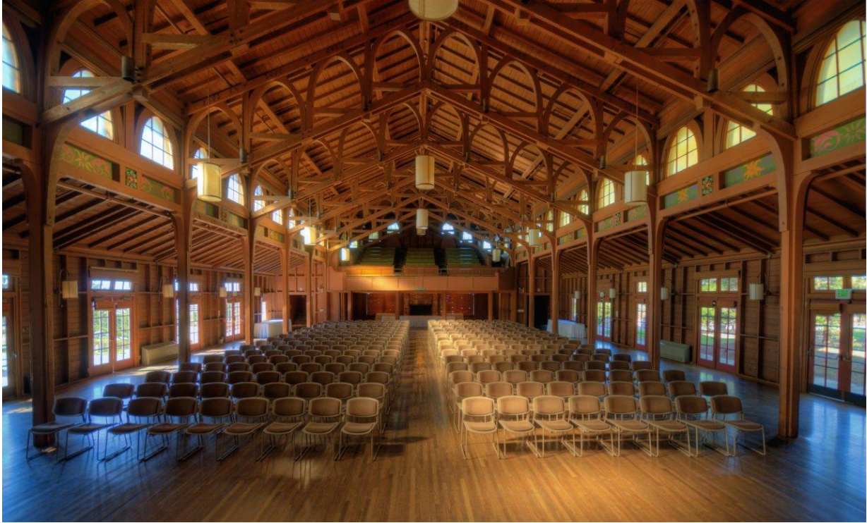
Asilomar, Pacific Grove, Monterey County