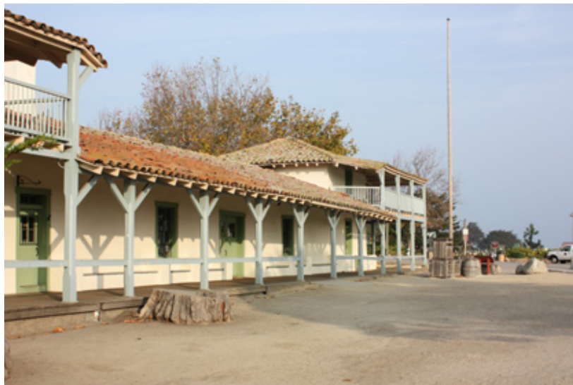
Custom House, Monterey, Monterey County

The Custom House is California Historical Landmark Number 1. The oldest portion was built in 1827 as a small one-story adobe building of two rooms. By 1846, the Custom House was a long, one-story tile roofed building, built of adobe and rock, with two-story hip roofed wings in the Monterey Colonial style at the northern and southern ends. The building, including the verandas, is 135 feet long and 34 feet wide. The ground plan is composed of four rooms in a straight line with inter-connecting doorways, and each with doors to the exterior. The large main room is approximately 19 feet by 60 feet and contains a brick fireplace. The ground floor level of the north (original) wing is two steps higher than the main room. Interior wood stairways lead to the second floors of the north and south wings. Windows on the ground floor have interior solid paneled shutter and iron bar grills on the exterior. Restored and rehabilitated in the early twentieth century, the building is maintained in excellent condition and is open to visitors as a museum. It lies within the boundary of the Monterey Old Town Historic District, a National Historic Landmark, and is designated an individual National Historic Landmark, resulting in listing in the National Register of Historic Places at the national level of significance, and subsequent automatic listing in the California Register of Historical Resources.